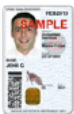
Active Duty Armed Forces

Vendor specific eligibility requirements may apply