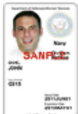
Retired APF and NAF DoD Civilian Employees