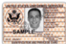
100% Disabled Veteran