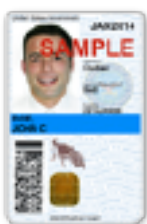
Active Foreign Affiliate (Non-U.S. Citizen)