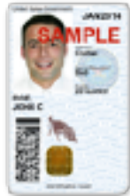
APF and NAF DoD and Uniformed Services Civilian Employees