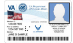
Department of Veterans Affairs