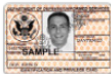
Active Duty Dependent